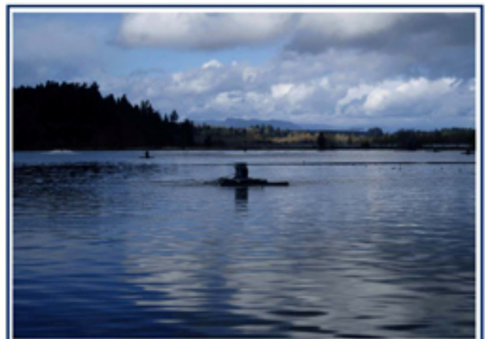
Float Mounted – Canada

For More Information – Please Contact MGD Process Technology Inc. Boylston, MA • 508-869-2164 • www.mgdprocess.com