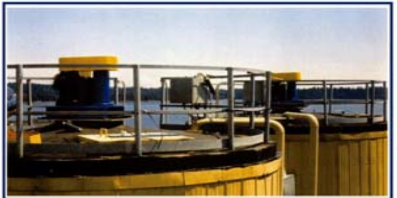
ATAD Installation – Canada

The simplicity of design results in a rugged, durable, low maintenance system providing superior mixing and aeration with reduced energy costs.