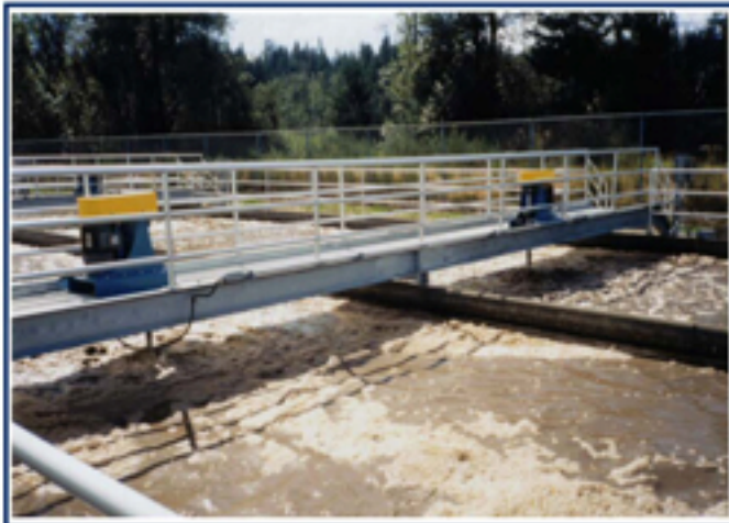
Oxidation Ditch – USA